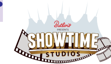
PHOTO SHOOTS IN THE SKYLINE PAVILION

Character photo shoots will last 20 minutes, we may stop people from queuing for the comfort of our characters.