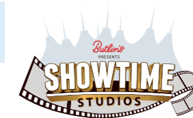
PHOTO SHOTS IN THE SKYLINE PAVILION

You are welcome to use the facilities around resort until 11am, but please vacate your accommodation by 10am. You can return your keys to Guest Services or leave them at the main resort exit.