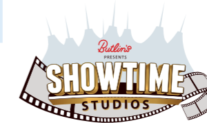
PHOTO SHOTS IN THE SKYLINE PAVILION

Character photo shoots will last 20 minutes, we may stop people from queuing for the comfort of our characters.