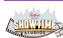
PHOTO SHOTS IN THE SKYLINE PAVILION

You are welcome to use the facilities around resort until 11am, but please vacate your accommodation by 10am. You can return your keys to Guest Services or leave them at the main resort exit.