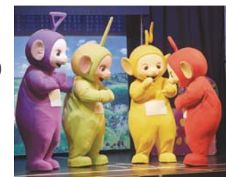
dhx TELETTUBBIES® and © 2019 DHX Worldwide.

Teletubbies™ Big Play Dates Skyline Pavilion (Sat 10am) Join Tinky Winky, Dipsy, Laa-Laa and Po as they dance, sing, and giggle in their fun-filled live show.