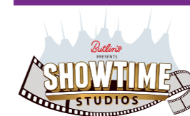
PHOTO SHOTS IN THE SKYLINE PAVILION

You are welcome to use the facilities around resort until 11am, but please vacate your accommodation by 10am. You can return your keys to Guest Services or leave them at the main resort exit.