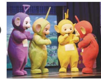
dhx TELETTUBBIES® and © 2019 DHX Worldwide.

Teletubbies™ Big Play Dates Skyline Pavilion (Sat 10am) Join Tinky Winky, Dipsy, Laa-Laa and Po as they dance, sing, and giggle in their fun-filled live show.