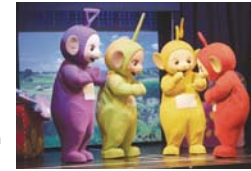
© DHX TELETUBBIES® and © 2019 DHX Worldwide.

Join Tinky Winky, Dipsy, Laa-Laa and Po as they dance, sing, and giggle in their fun-filled live show.