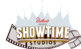
PHOTO SHOTS IN THE SKYLINE PAVILION

Character photo shoots will last 20 minutes, we may stop people from queuing for the comfort of our characters.