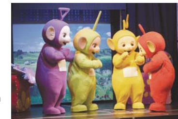
dhx TELETTUBBIES® and © 2019 DHX Worldwide.

Skyline Pavilion Join Tinky Winky, Dipsy, Laa-Laa and Po as they dance, sing, and giggle in their fun-filled live show.