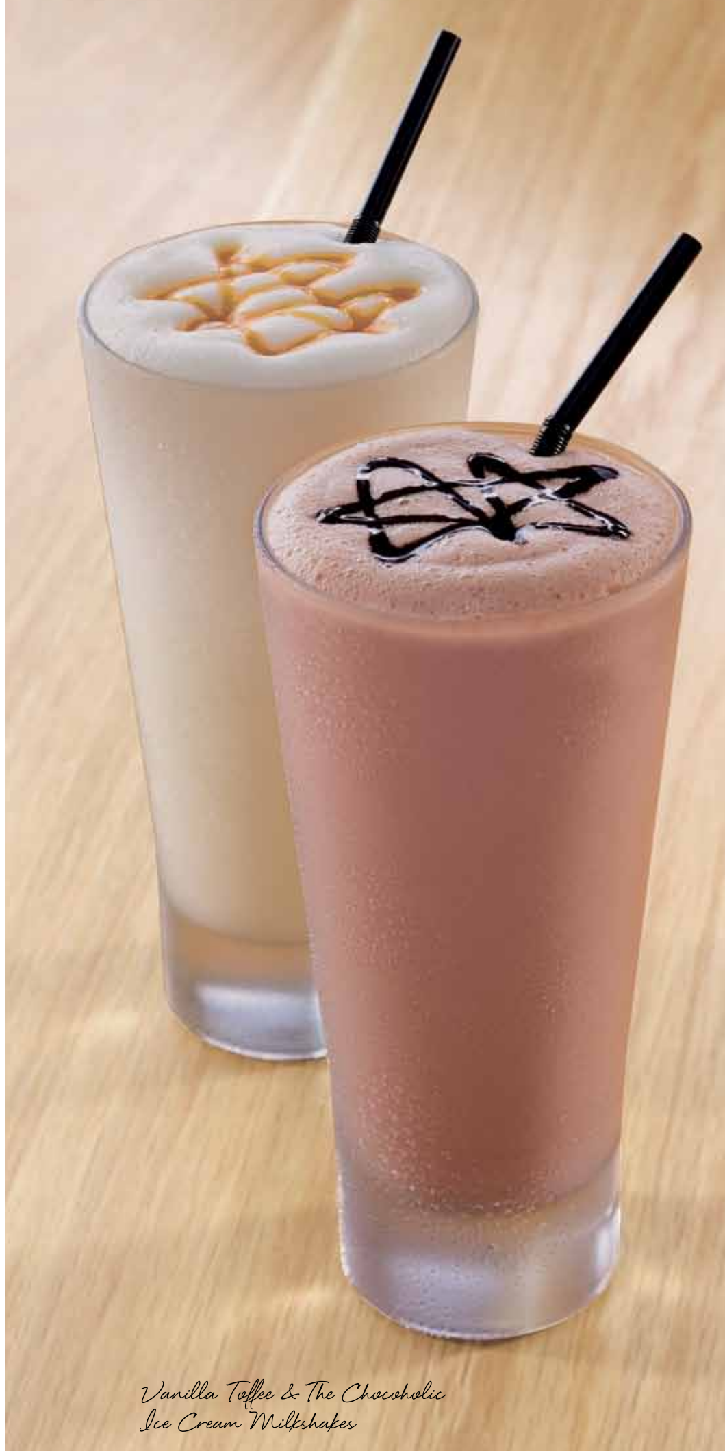
Vanilla Toffee & The Chocoholic Ice Cream Milkshakes