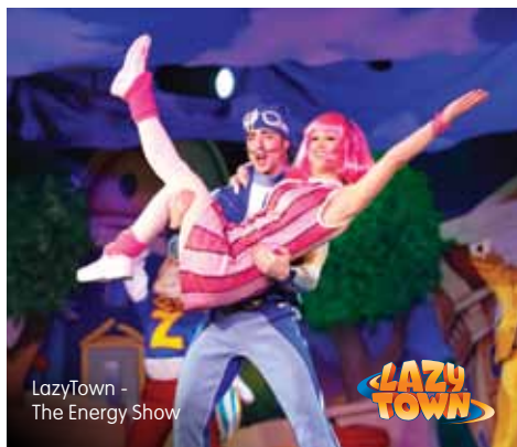
LazyTown - The Energy Show