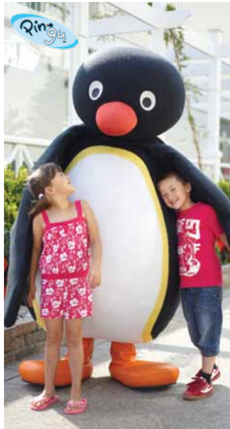
© 2012 HIF Entertainment Limited. © 2012 The Pyggos Group