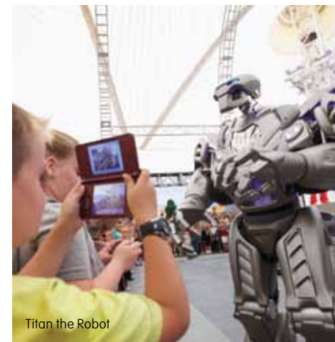
Titan the Robot

Our wrestlers take centre stage to sort out who's king of the ring.